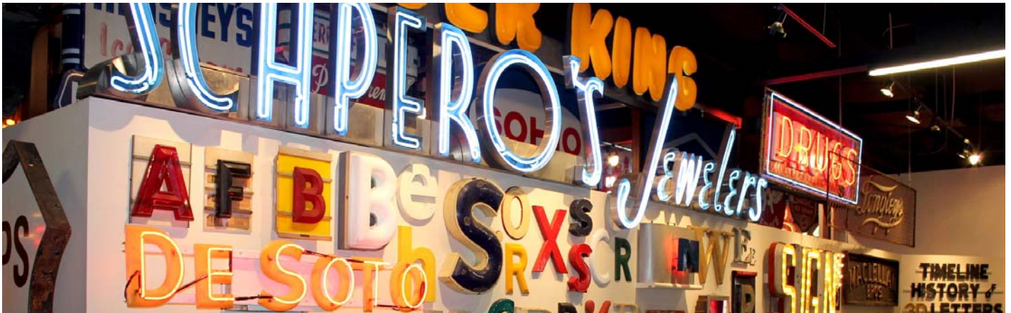
Signs of all kinds will be on display during the Ohio Valley Early Birds visit to the American Sign Museum on November 17