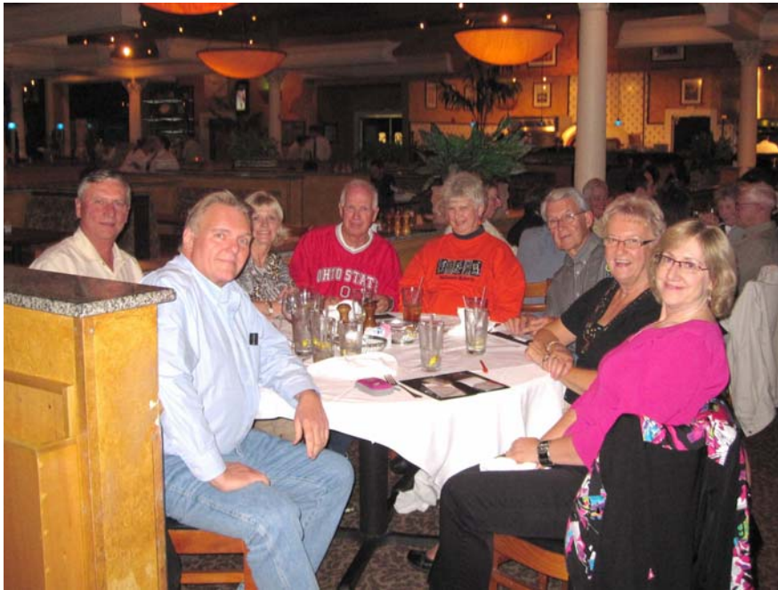
Eight hearty OVEB members didn't let the wind and rains that cancelled the Spring Grove Cemetery Cruise-In spoil their fun. Alternate plans were quickly hatched to meet at Bravo in West Chester for a leisurely meal.