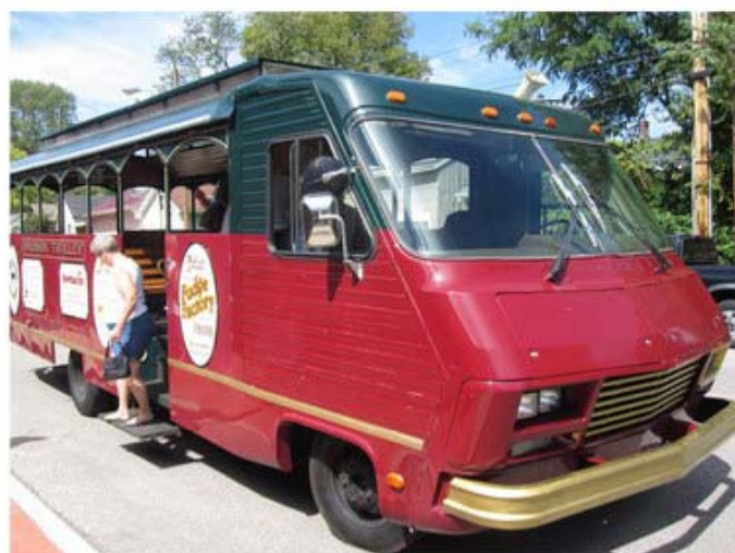
A converted motorhome serves as Madison's tourist trolley