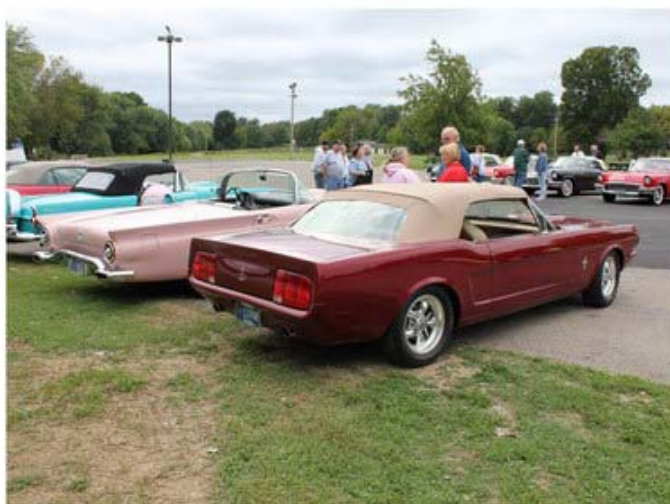
We all headed to Ogle Riverfront Park for the cruise-in