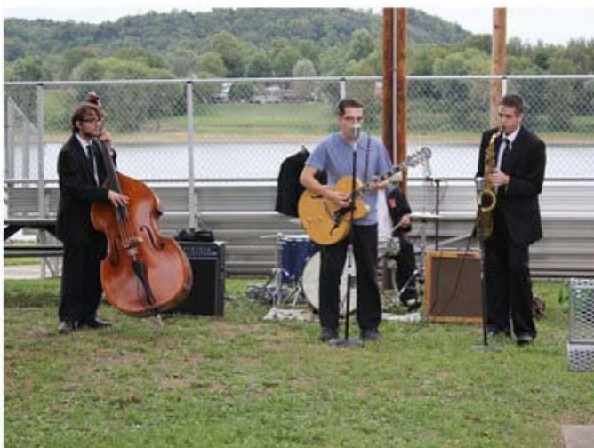
"The Makeshifts" provided musical entertainment