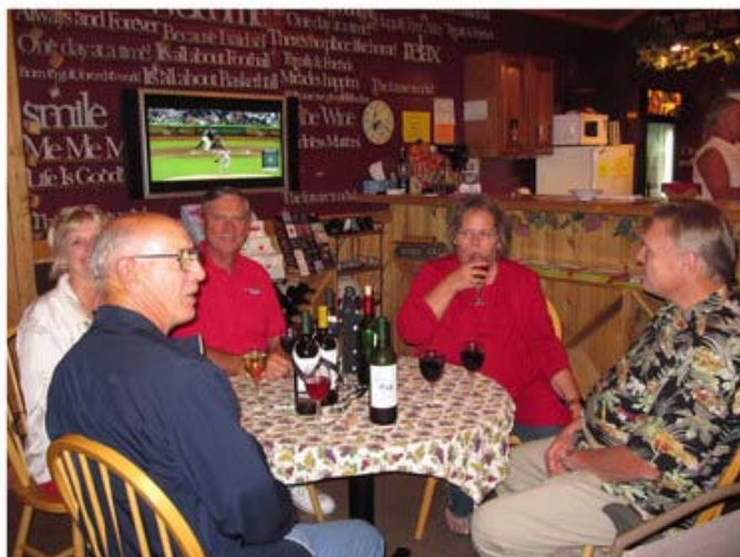
After the cruise-in, we headed back to the winery for pizza & wine