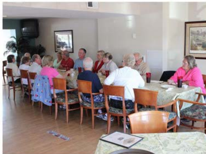
Our two clubs filled the Sunset Grill's dining room