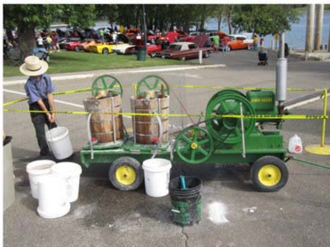
Ice cream maker powered by John Deere "hit & miss" engine