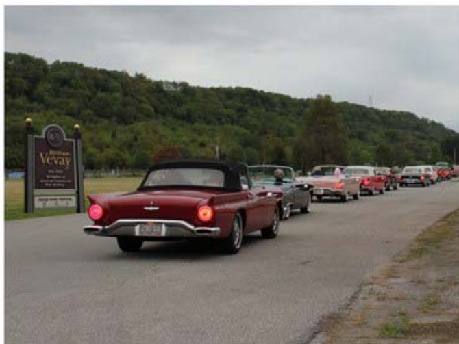
This cruise-in actually included a "cruise" around downtown Vevay