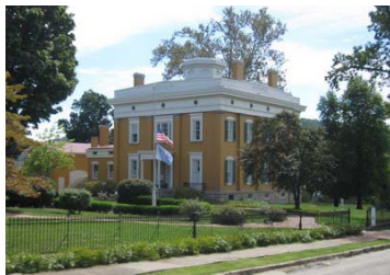
The Lanier Mansion, Madison, Indiana