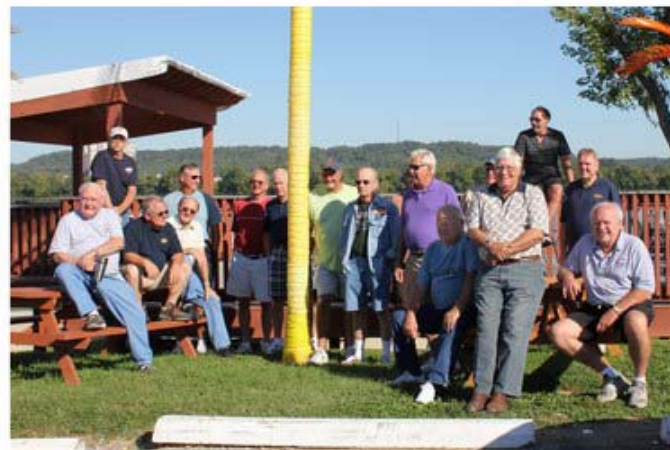
The Indiana and Ohio men reluctantly do likewise