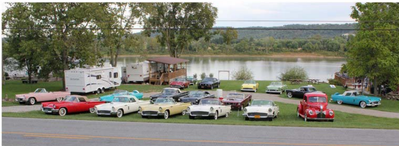
15 delightful baby birds make a very colorful impression on the grounds of the Ridge Winery in Vevay, Indiana