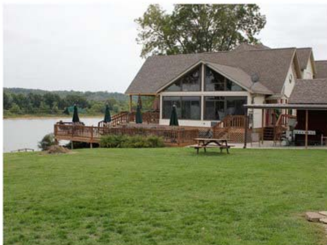
The Ridge Winery has a lovely setting on the Ohio River