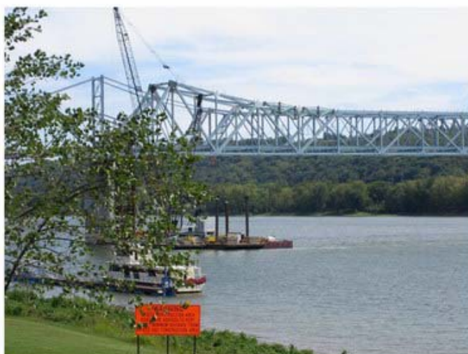
A new bridge over the Ohio River will be slid into place when finished