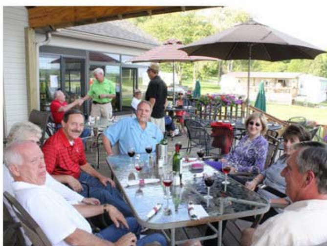
OVEB members enjoy a glass of wine before dinner