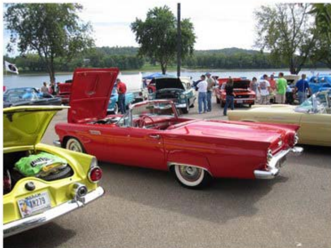
EBOH T-Birds were very competitive at Saturday's car show