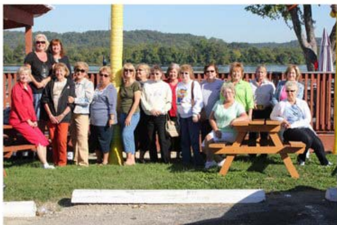
The EBOH & OVEB women pose for a group photo