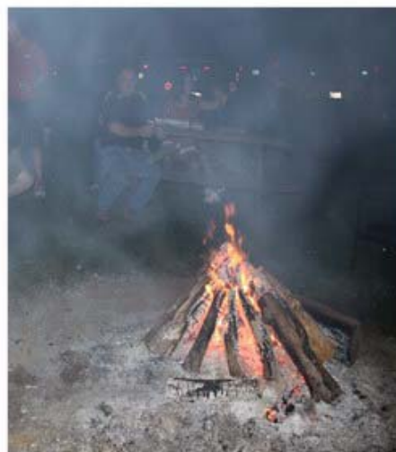
The bonfire offered a fitting end to the evening