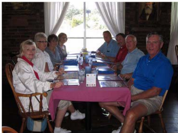
We enjoyed lunch at the Key West Shrimp House in Madison