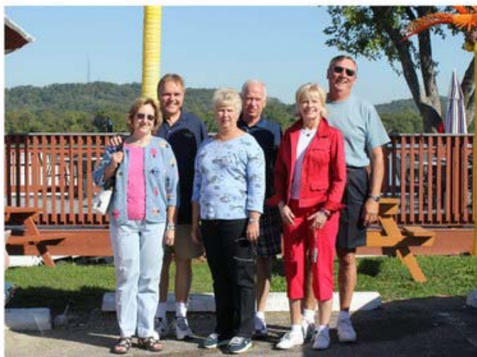
Now just the OVEB members ... say cheese