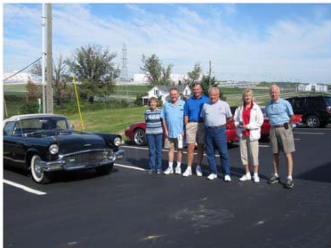
OVEB & EBOH members at Ramada Inn near KY Speedway