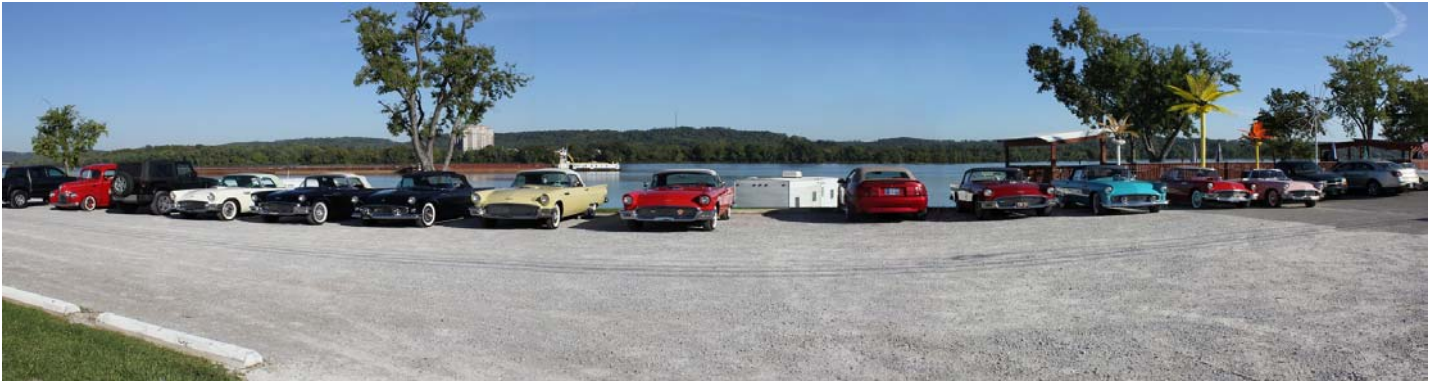
T-Birds and other classic cars belonging to Ohio Valley Early Birds and Early Birds of Hoosierland members line up along Ohio River for breakfast at the Sunset Grill in Warsaw, KY