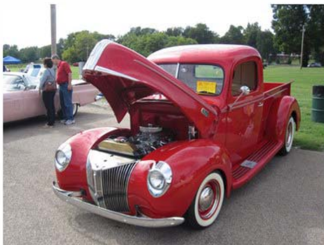
Donnie Lucas' custom '41 Ford pickup sports a bowtie powerplant