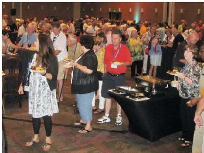
The SRO CTCI welcome reception featured Memphis barbeque