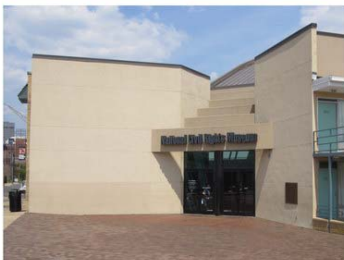
National Civil Rights Museum covers the struggle for racial equality