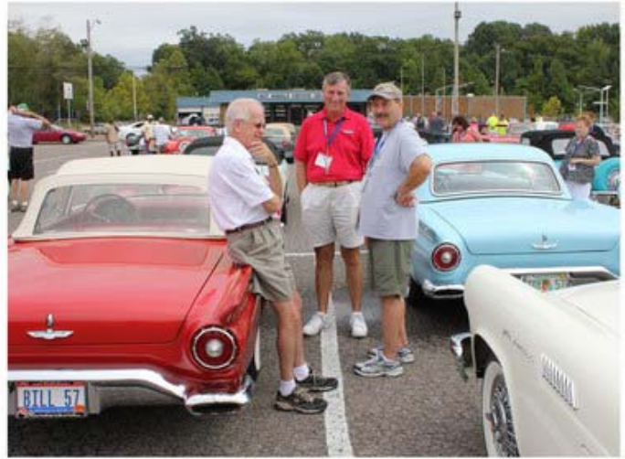
Elvis must have arranged for the rain to stop soon after we arrived