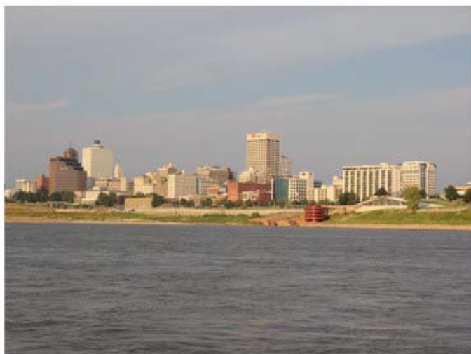
Downtown Memphis from the water