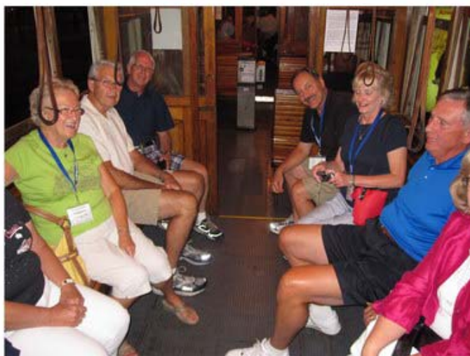
After dinner, we grabbed a trolley and headed to Beale Street