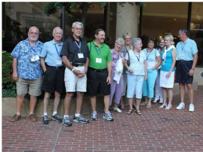
"I'm goin' to Graceland, Graceland, Memphis Tennessee.."