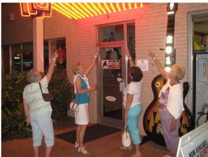
All hail the "King"