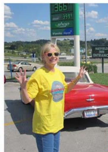
Just wait till you see my Elvis shades