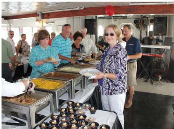
What's for dinner? Barbeque? Now that's a surprise