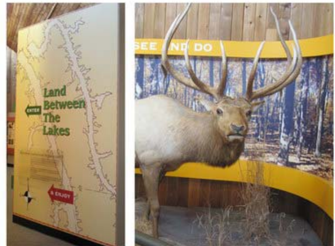
Inside the visitor center