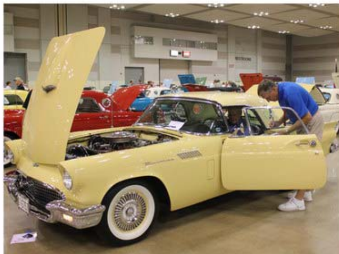
"That parking light is definitely on...off...on...Oh, it's a turn signal?"