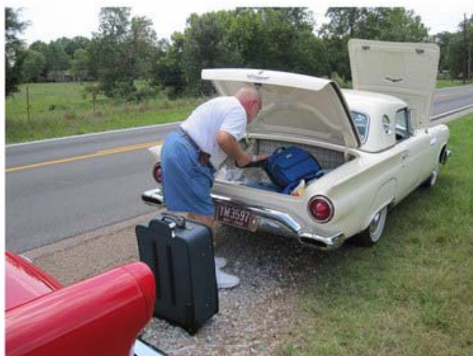
I'll just move my luggage to the chase vehicle and then wait for AAA