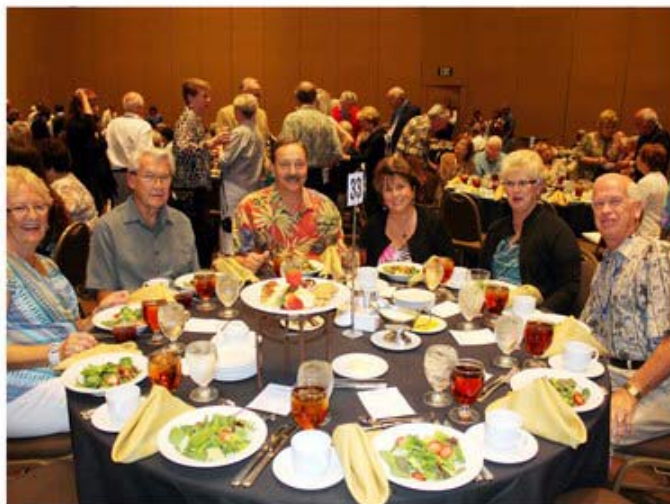
We feasted on steak and chicken instead of the ubiquitous barbeque