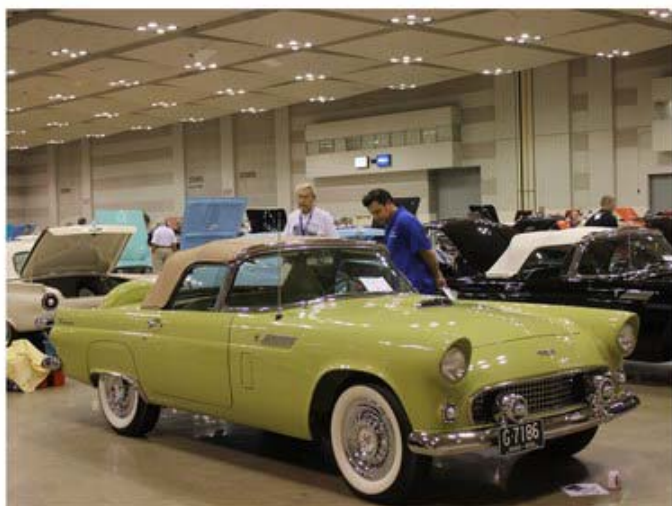
Walt Berhardt's Concours I Primary Original '56