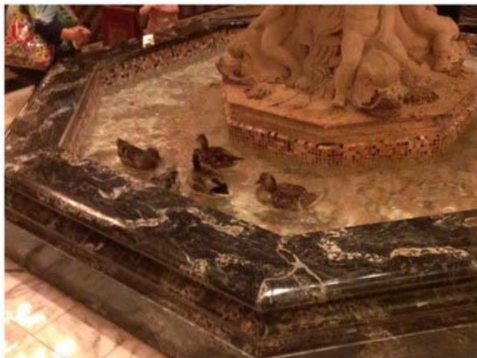
The ducks return to their rooftop penthouse each evening at 5 p.m.