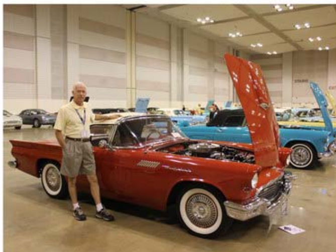
I think I'm ready to hit the casinos