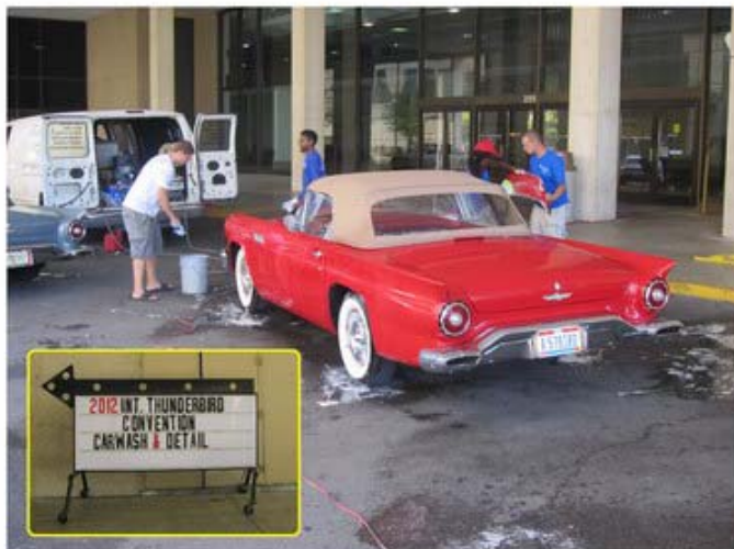
The "pay someone else to wash your car" concession was popular