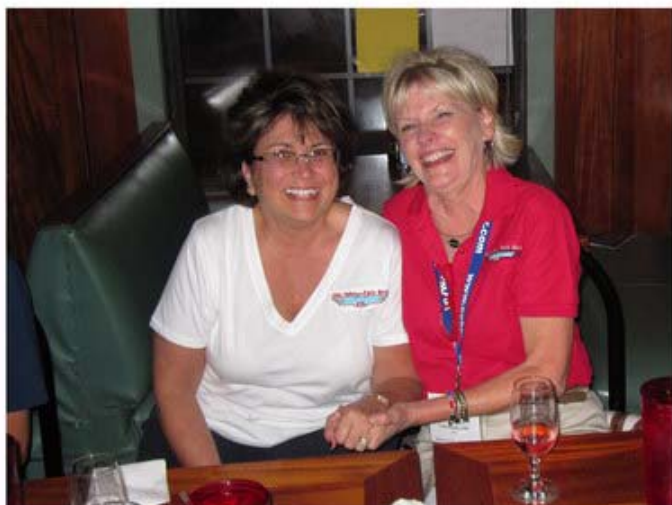
Much drinking and hilarity ensued