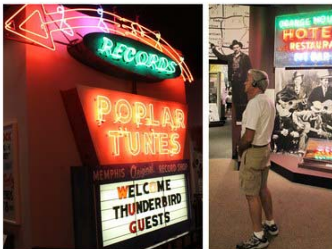
Walt and other T-Bird visitors felt very welcome at the museum