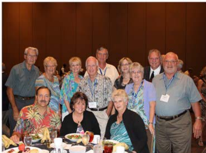
Jan's advance efforts secured us a table at the banquet