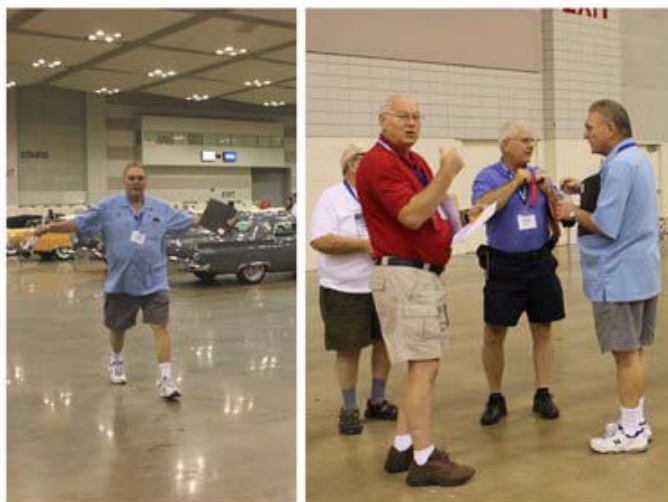
Anyone seen my fellow touring judges? Oh, there you are.