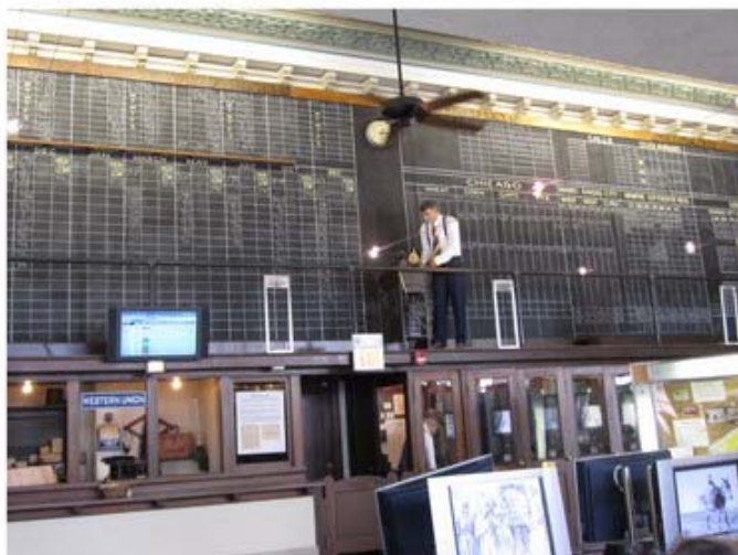
The Cotton Museum at the Memphis Cotton Exchange