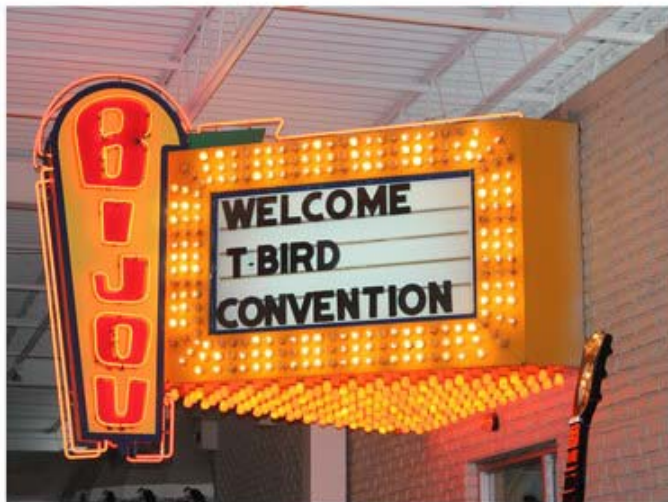
Elvis says, "Thank y'all for coming. Thank ya very much."