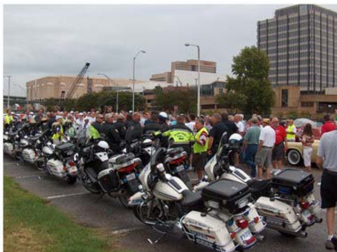
Police motorcycle officers explain the rules of the road