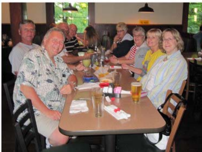
Half price cerveza with dinner at Mexican restaurant near our motel