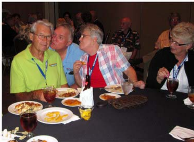
Gee Walt, you smell really nice