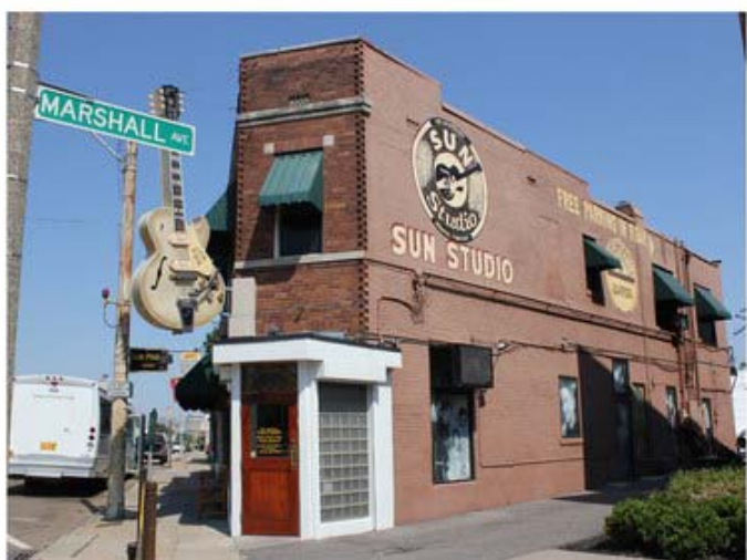
The historic Sun Studios, birthplace of Rock-n-Roll