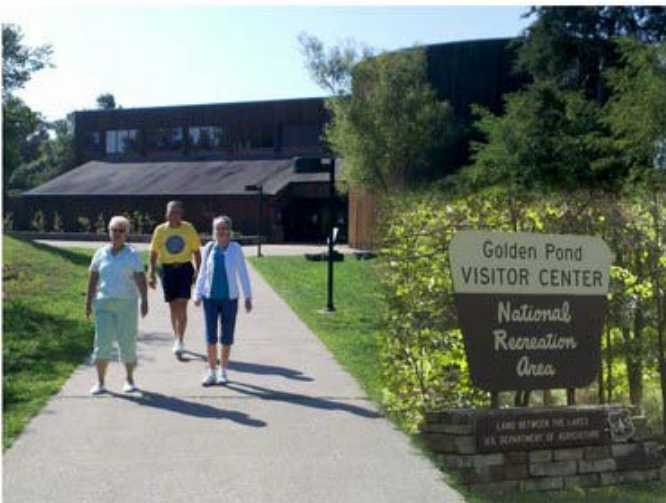
The Land Between the Lakes Golden Pond Visitor Center