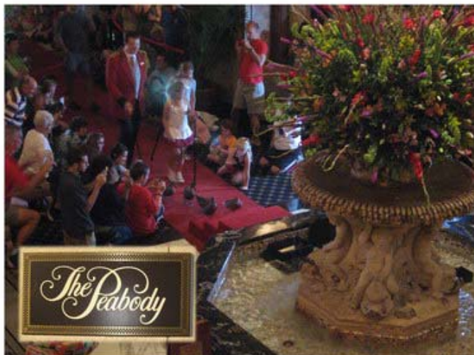
The Peabody ducks march to the hotel lobby fountain daily at 11 a.m.