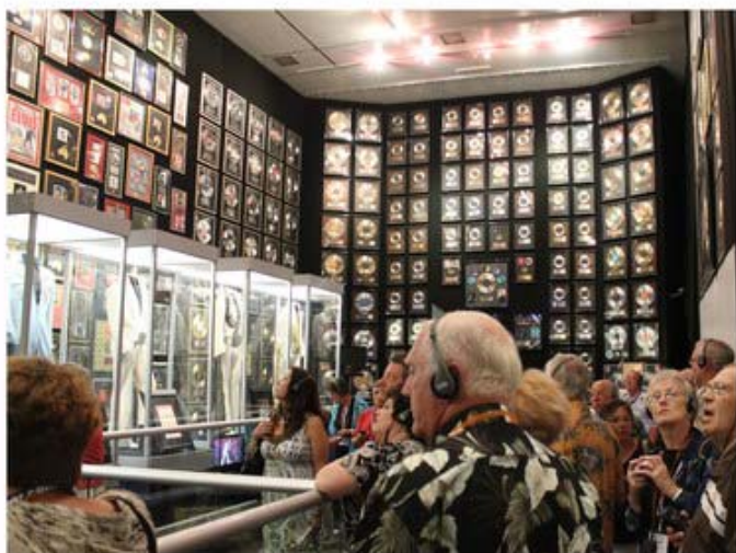
Elvis' jumpsuits & gold records fill the racquetball court