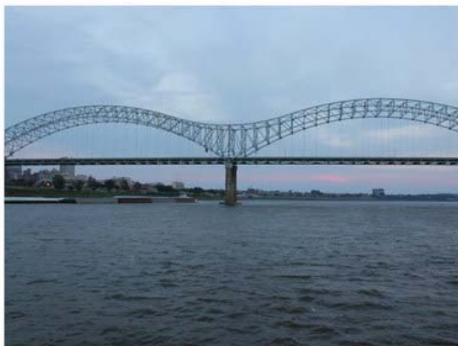
The Hernando de Soto Bridge connects Memphis, TN with Arkansas