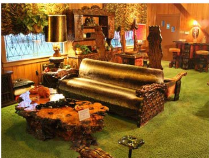
The "Jungle Room" celebrates Elvis' unique taste in home furnishings