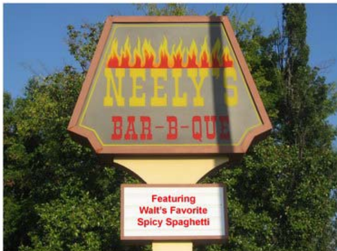
Dinner was at Neely's Bar-B-Que, just a few blocks from our hotel