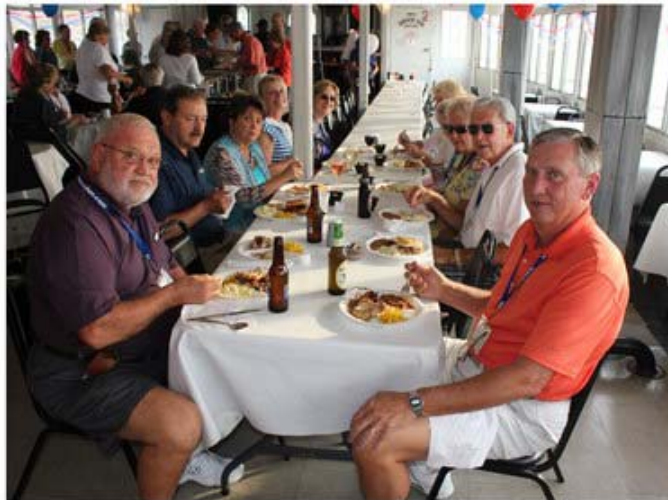
The band entertained us with a special rendition of "T-Bird Sally"