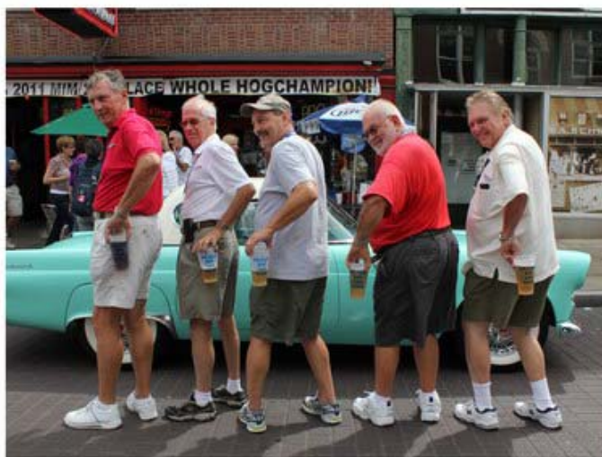
Hey guys. Why don't you hold your "Big Ass" beers next to your...