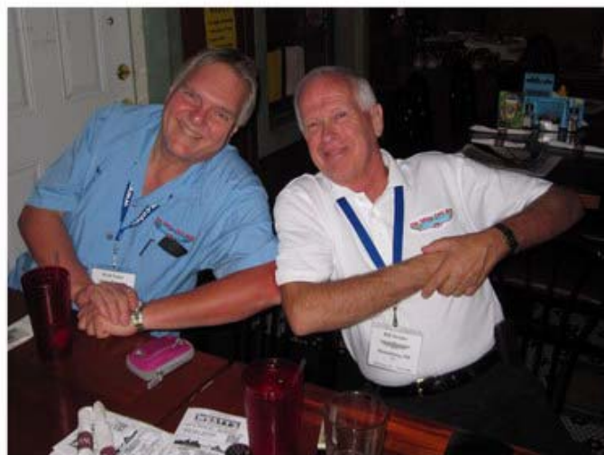
Just two dudes who enjoy driving red 1957 Thunderbirds