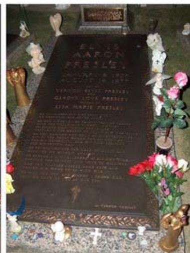
Elvis' final resting place