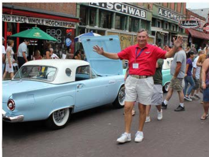
Please, please. No more photos