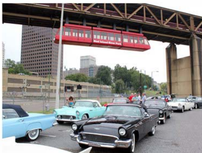
T-Birds lined up under the Memphis Mud Island Monorail