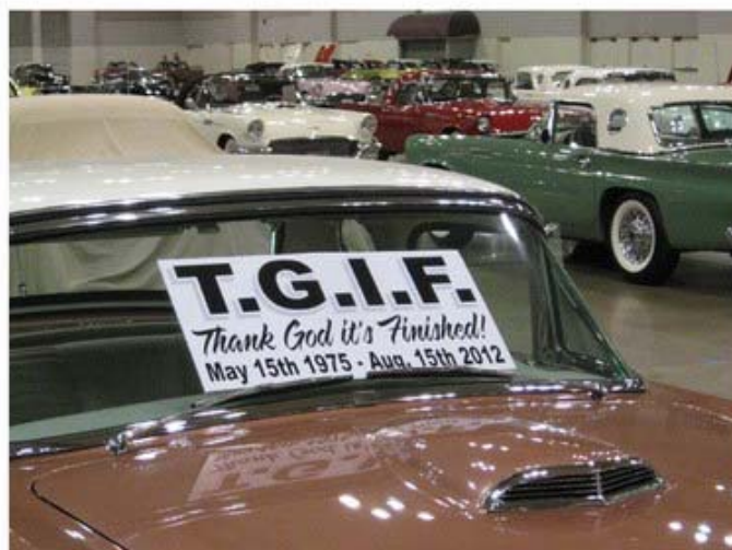
Many attendees could relate to this sentiment