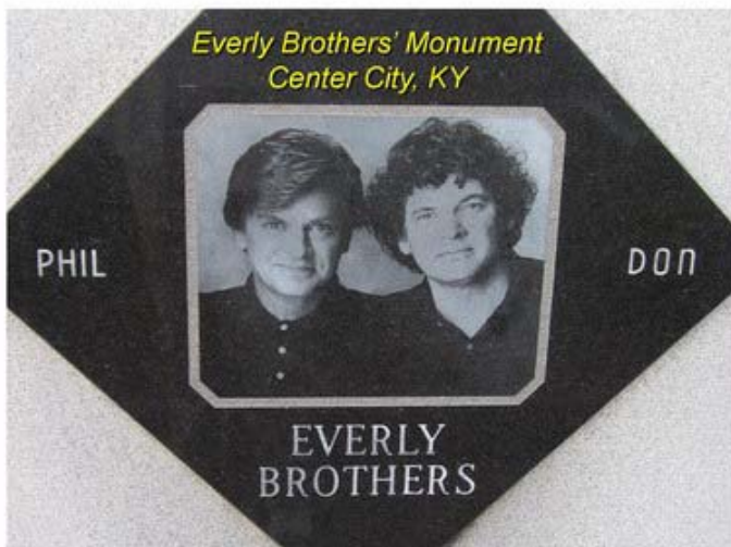
We spent the night in Center City, KY, birthplace of Don Everly