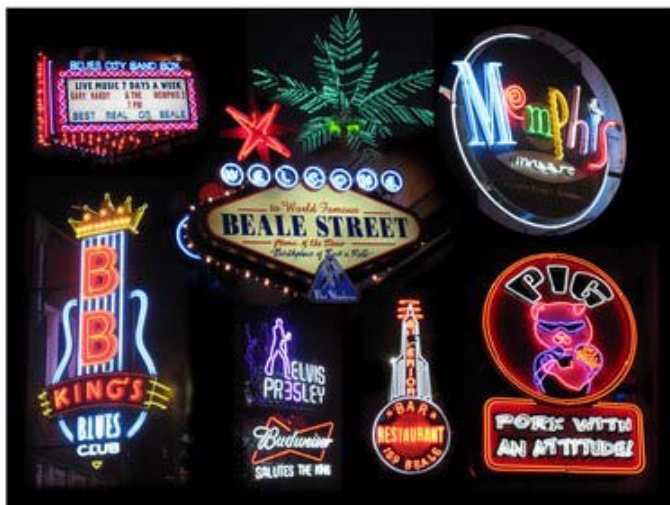
A small sampling of Beale Street neon