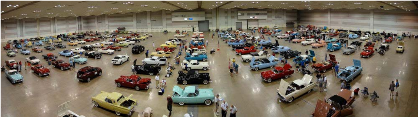
Concours panorama