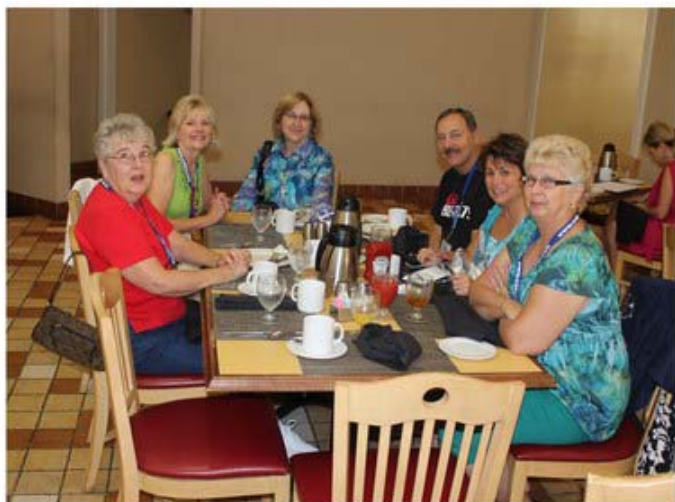
Ohio Valley Early Bird members gather for breakfast in hotel