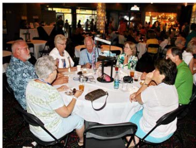
Unlike the unlucky folks on other buses, we were seated immediately