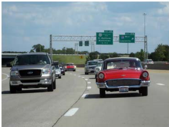
After a nice jaunt on US-42, we hit the Interstate in Louisville