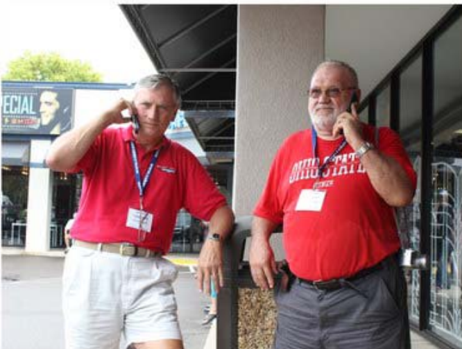
"Hello NAPA. Do you have a 7280 battery in stock?"