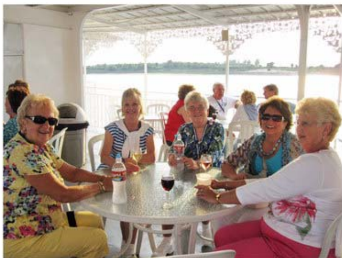
After dinner, the ladies enjoyed some wine...