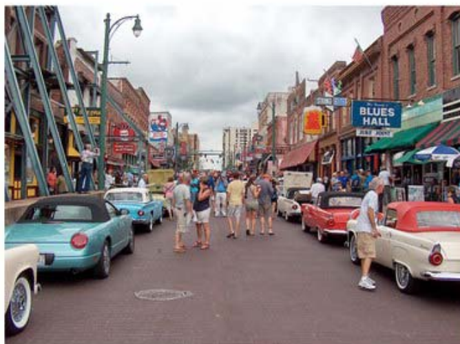
T-Birds lined both sides of Beale Street and throngs of locals stopped by to admire them