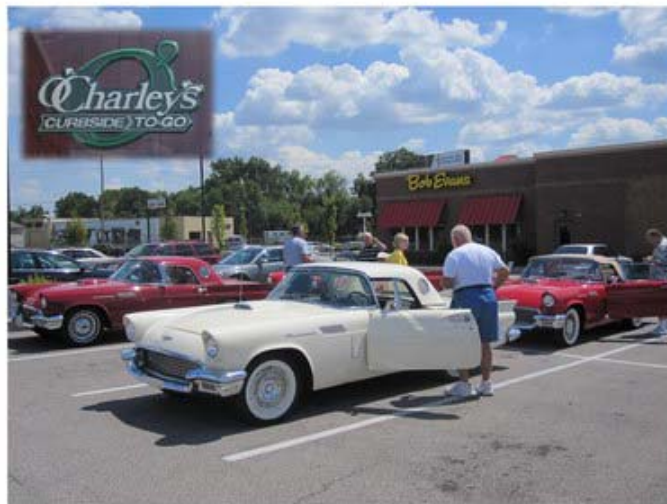
Lunch stop at O'Charley's near Louisville