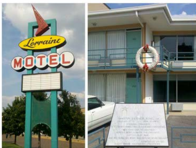
The Lorraine Motel where Dr. Martin Luther King, Jr. was slain