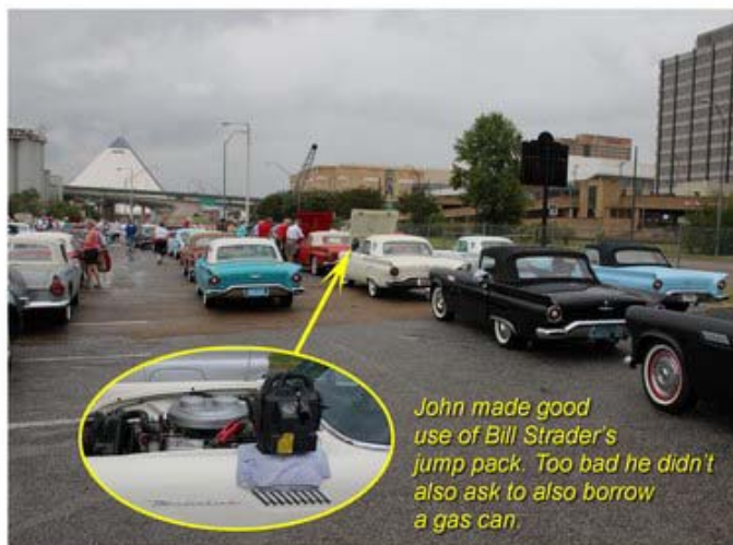
T-Birders muster Saturday morning for caravan to Graceland