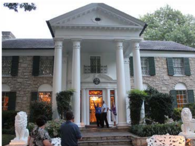
The front entrance of Elvis Presley's Graceland