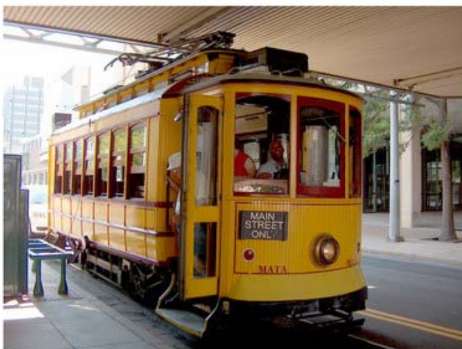
Vintage trolleys passed the convention hotel every few minutes