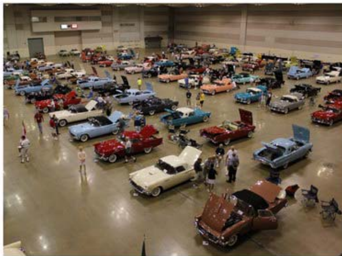
Over two hundred classic T-Birds filled Memphis' climate-controlled Cook Convention Center