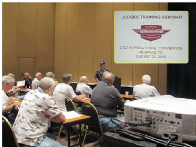
Concours and touring judges spent half a day in training sessions