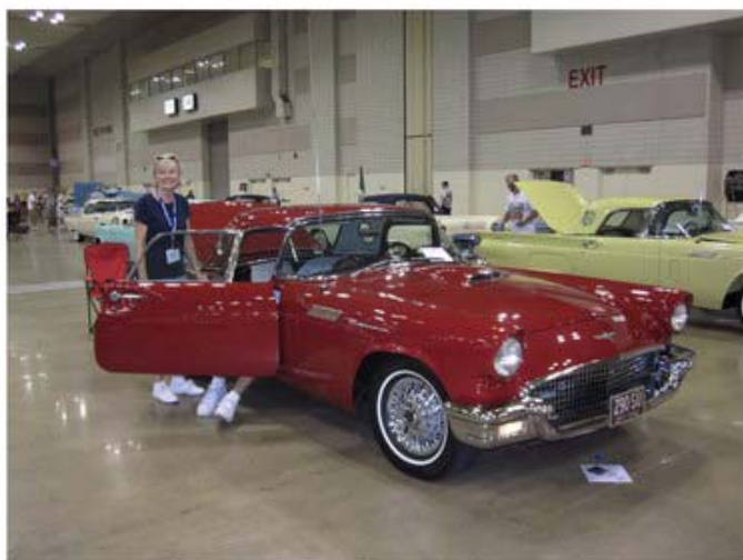
Gail is busy supervising while Bill details the interior