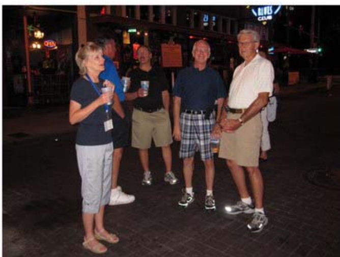
Open container? No problem