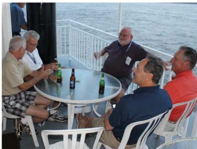
...while the men enjoyed some suds