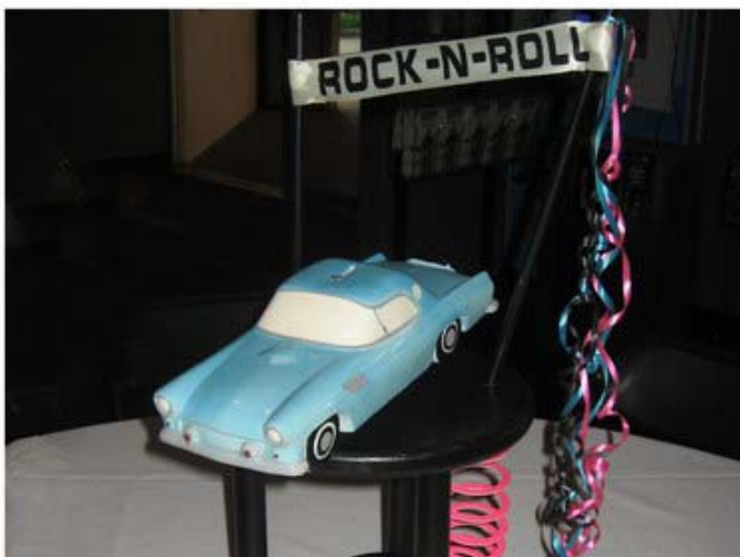
We even had a model of Glenn Forsell's car as a centerpiece