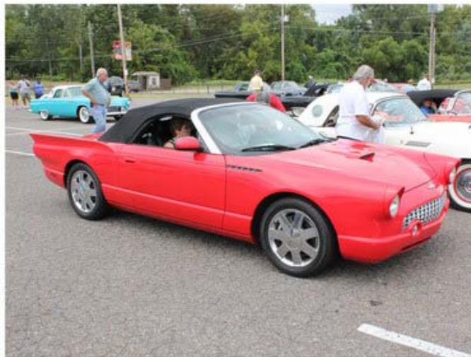
Is this what you call an extra retro, retro bird?