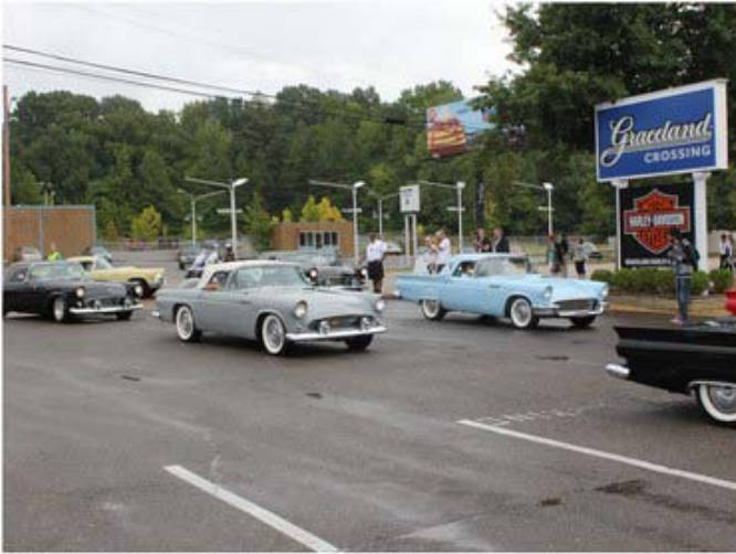
The caravan ended at the Graceland visitor center parking lot