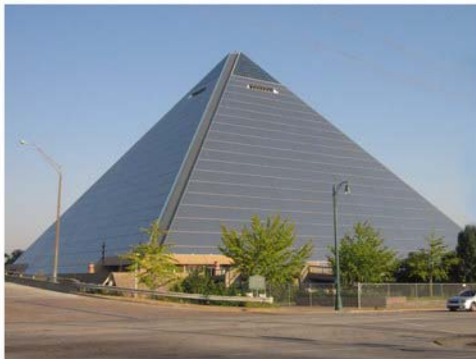
This future home of Bass Pro Shops evokes ancient Egypt