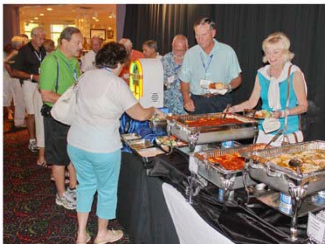
A very tasty meal was catered by Elvis' favorite Italian restaurant