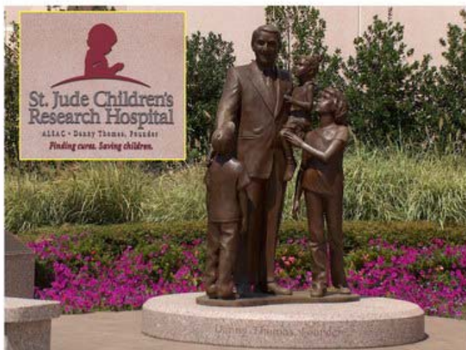
St. Jude Children's Hospital statue of founder Danny Thomas