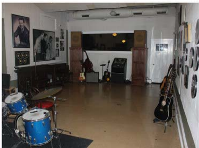
The studio where Elvis, Johnny Cash and others made history