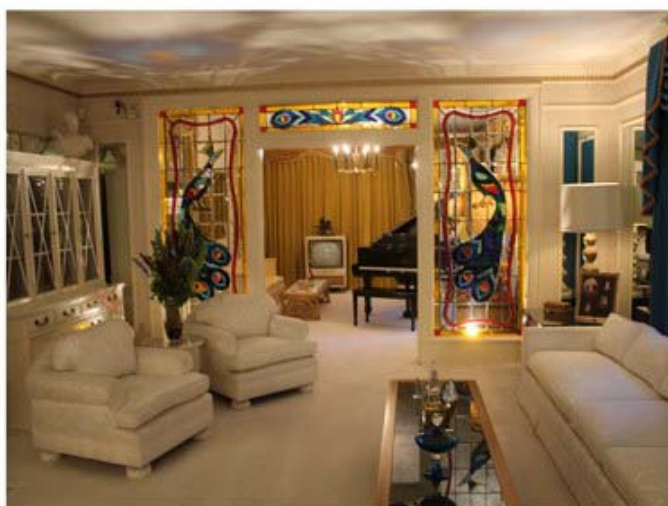
The living room at Graceland