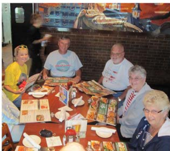
Everyone seems pretty happy that we completed the first leg of our journey without incident