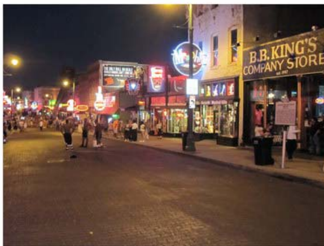
Beale Street wasn't too crowded on a Tuesday night