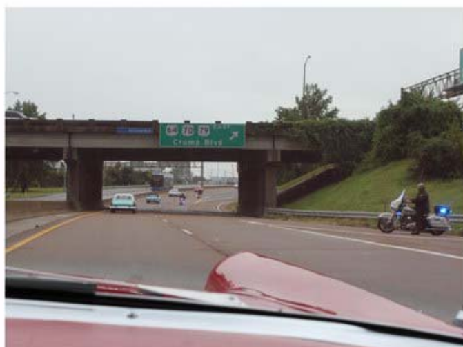
Our police escorts closed the interstate to all but T-Birds