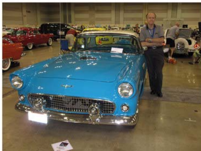
Looks perfect. Guess I'll go engrave some plaques.