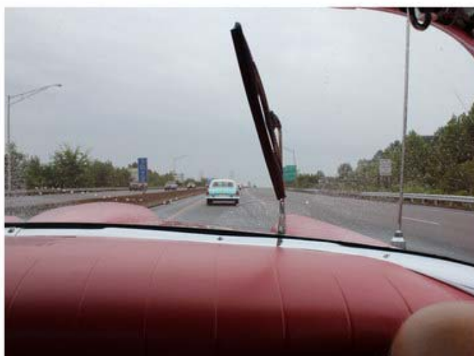
Those vacuum wipers really do the job - especially while accelerating