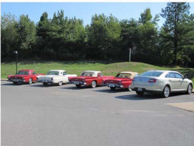
Four baby birds and "chase" car at visitor center