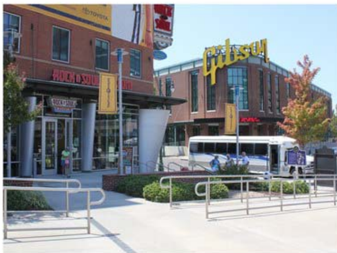
The Rock 'n' Soul Museum honors the evolution of the Blues