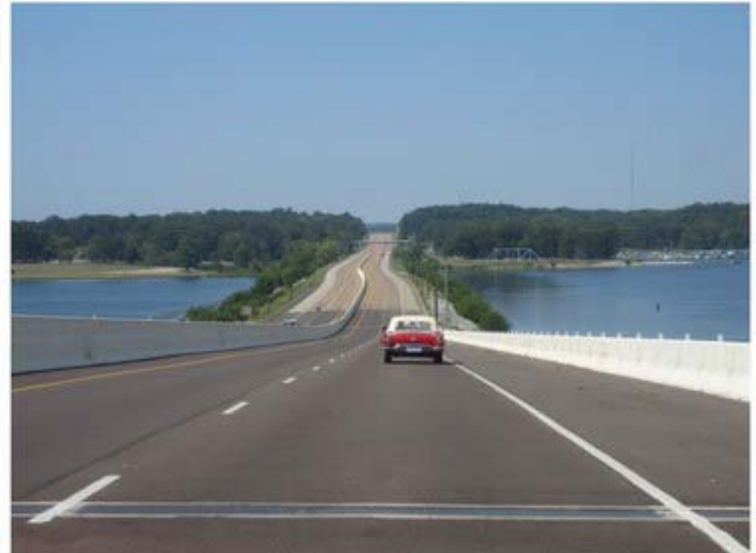
A T-Bird between the lakes