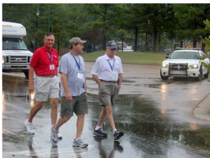
After a week of perfect weather, rain arrived for the caravan