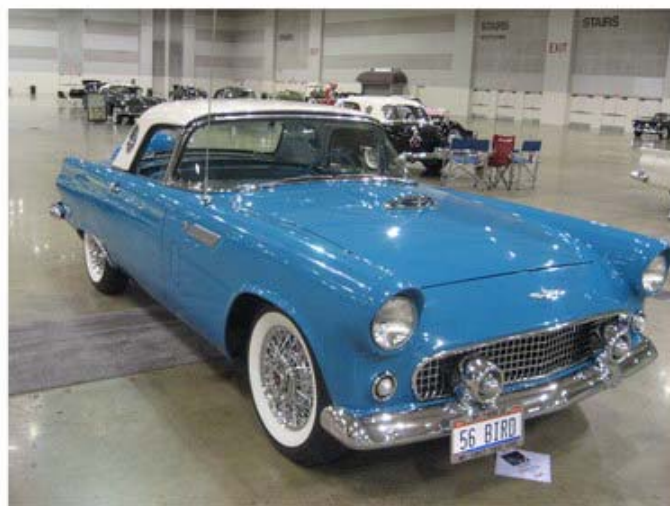
Glenn Forsell's Concours II Primary Non-Original '56