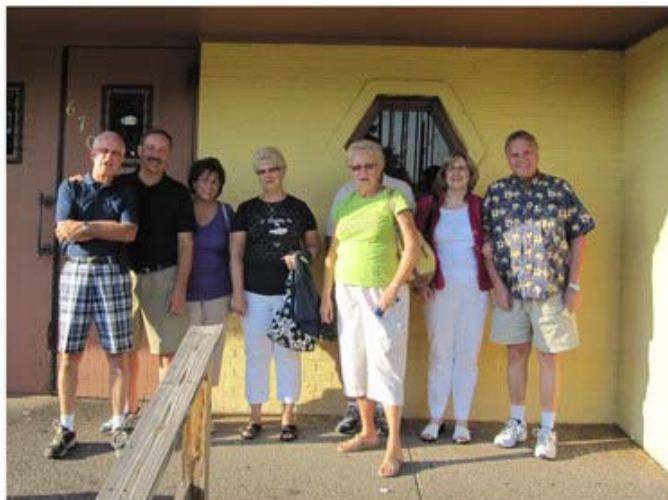
We didn't know that every other meal in Memphis would also be BBQ