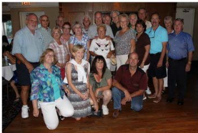
Say cheese everybody