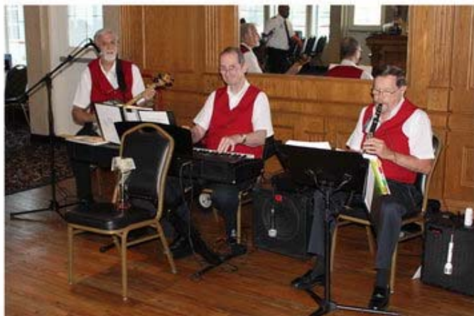
The band kept things swinging