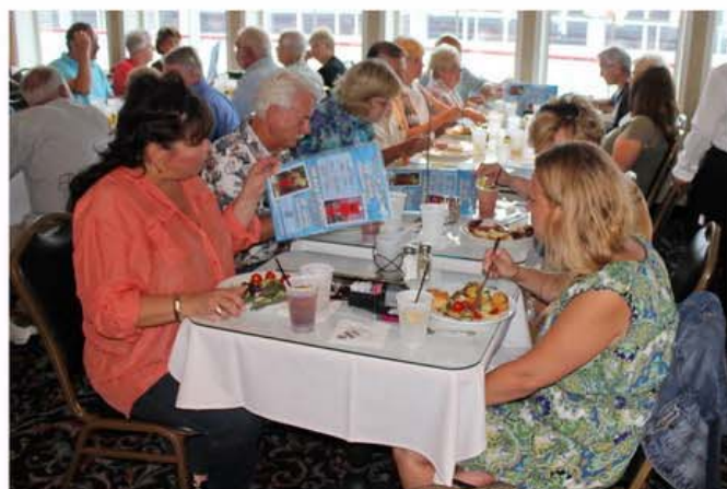
Ohio Valley Early Bird members filled two tables