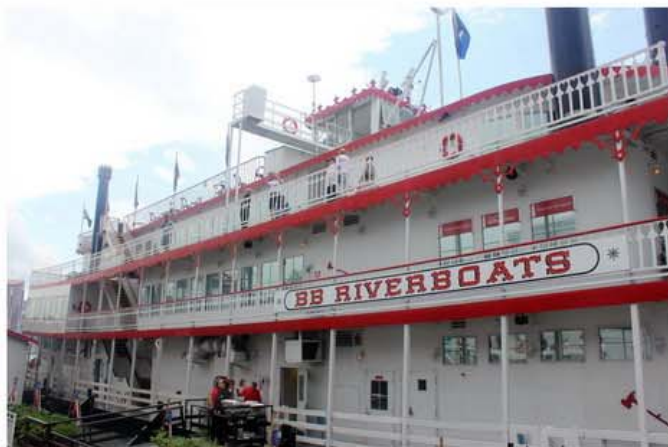
The Belle of Cincinnati at the BB Riverboats dock in Newport, KY