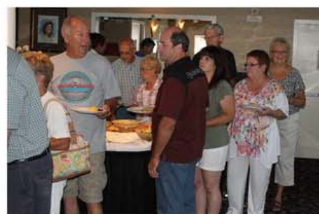
Everyone seemed to enjoy the brunch