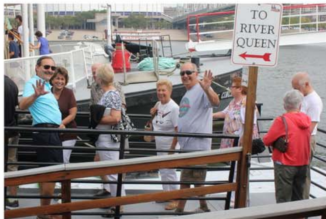
The gang prepares to board the Belle of Cincinnati