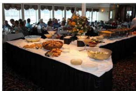
The Belle provided a sizeable spread