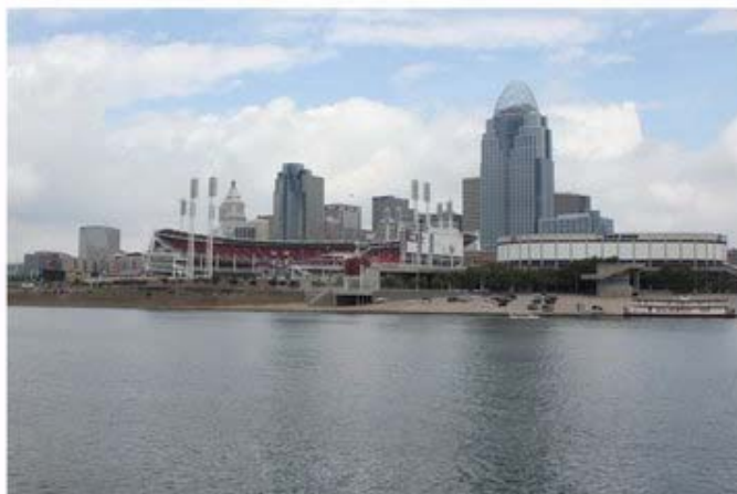
Downtown Cincinnati as viewed from the Belle