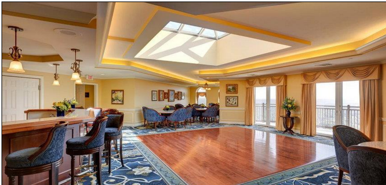
Event Space on the 16th Floor of the Kenwood

OVEB members are what make this club effective. You organize and lead our monthly meetings and plan our overnight excursions. Over the years, as we've gotten to know one another, our gatherings have become as much about spending time with friends as they are about driving and working on our cars.