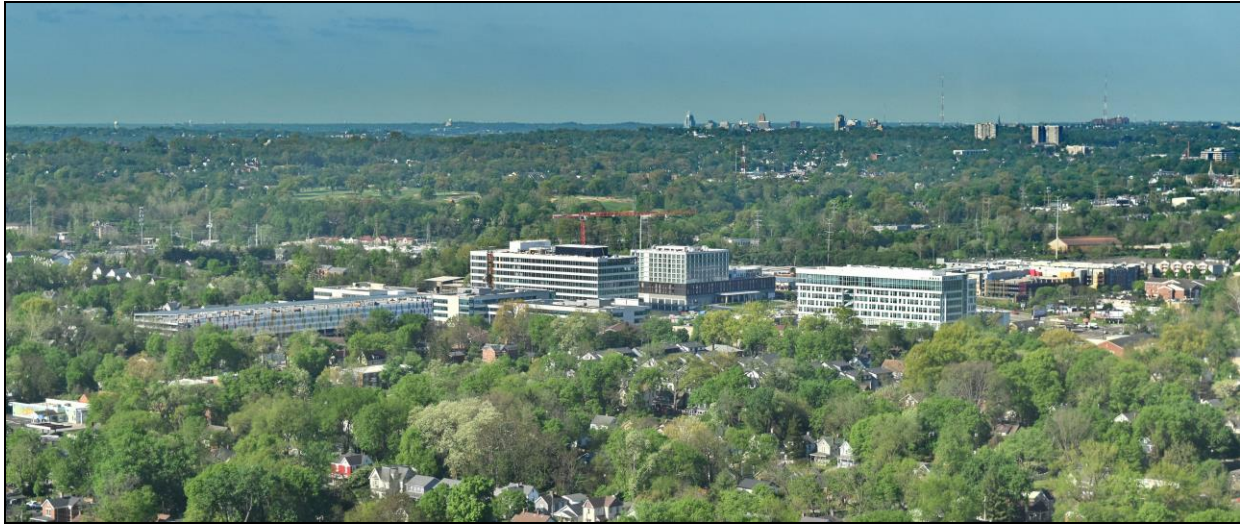
Just one of the spectacular views from the 16th floor of the Kenwood

If you've ever wondered about the massive building perched high atop Kenwood Road that resembles a Las Vegas casino, this is your chance to see the inside. The Kenwood is actually a high-end senior living community located mid-way between Mariemont and Madeira. The large party room on the top floor of the building offers spectacular views of the surrounding area. The facility is not generally available to outside organizations. We were only able to secure this space because of the efforts and connections of one of our members. After lunch, you'll be invited to tour this amazing facility.