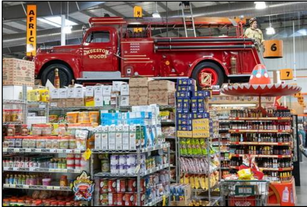
Fire Engine in hot sauce department