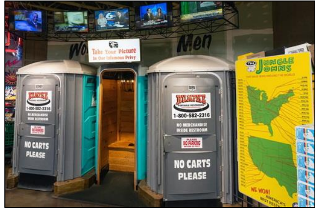
Jungle Jim's award-winning restrooms

After the scavenger hunt, we'll hold a very brief meeting and then depart for lunch at the nearby Acapulco Restaurant. Please see the map on the last page for driving details.