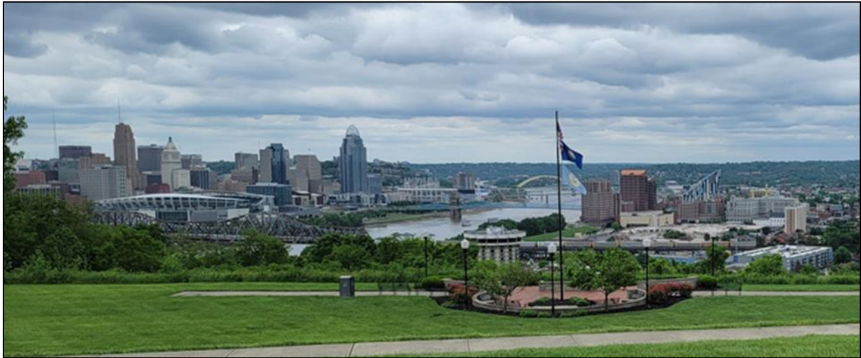
View of Downtown Cincinnati & Covington, KY from Devou Park Scenic Overlook