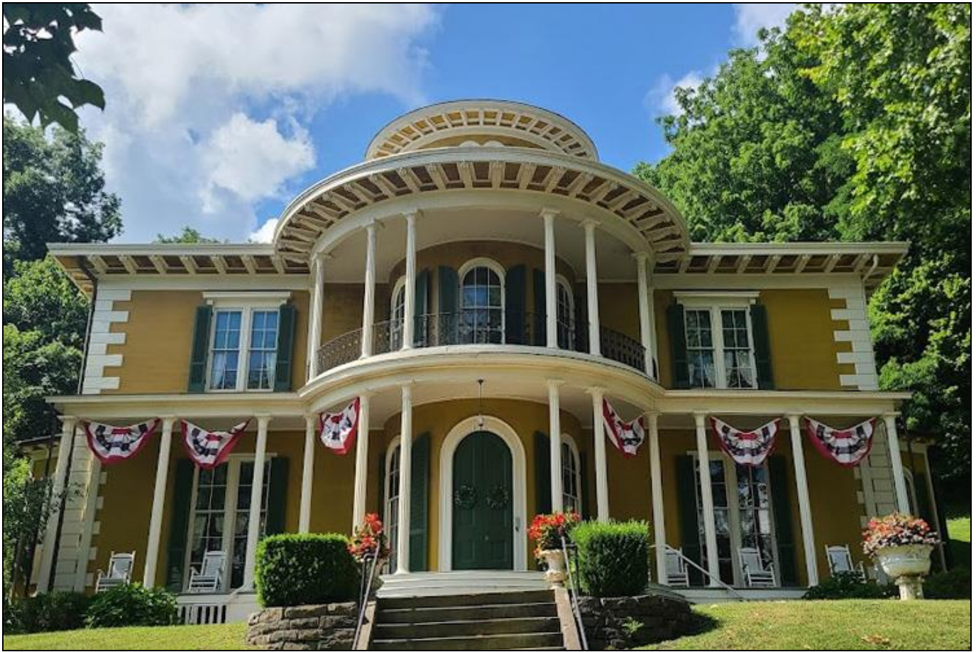
Hillforest Victorian House Museum, 213 Fifth Street, Aurora, Indiana